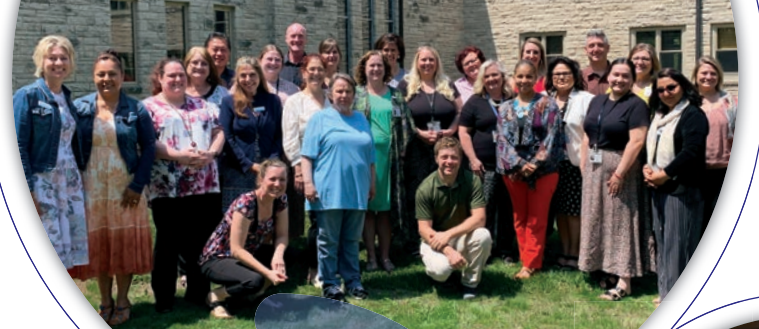
Catholic Charities Team

Catholic Charities Purpose Statement: As missionary disciples, Catholic Charities labors in our communities serving and inviting those who have often been left out or felt alone to know and experience the tremendous and abundant love of God through his Son Jesus Christ.