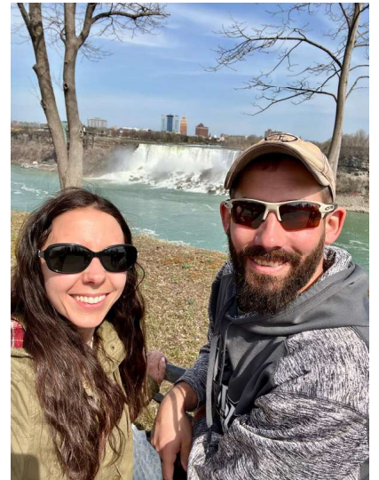
Enjoying Niagara Falls from Canada.

Anticipating potential difficulties upon expanding our family, we discussed adoption early in our relationship. Our perspective on adoption centers around creating an environment where we can share our love with both our child and their biological family.