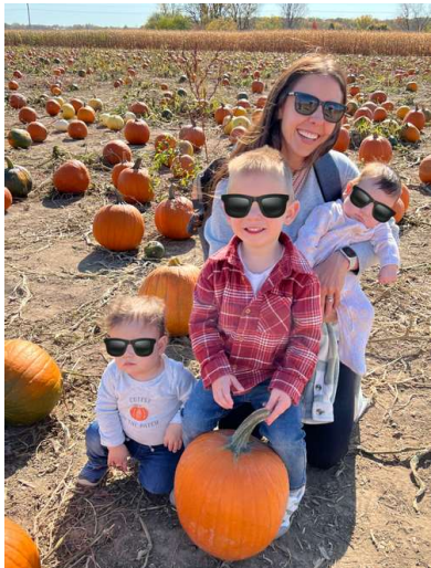
Visiting Nashville, TN with a couple friends